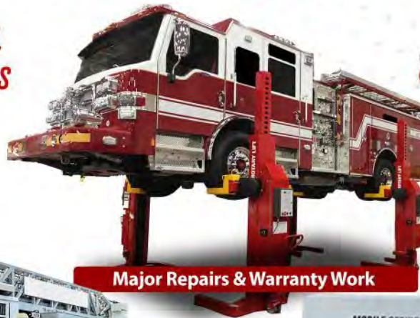
Major Repairs & Warranty Work