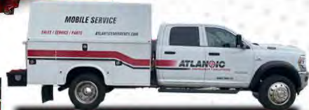
Mobile & 24 Hour Emergency Service

Providing faster and more convenient service in Kentucky and beyond.